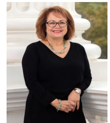
Maria Elena Durazo